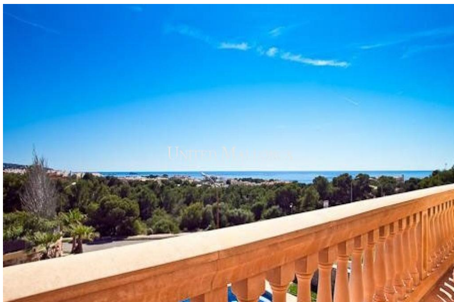
MEDITERRANEAN SEA VIEW VILLA, SOUTH-FACING, CLOSE TO PORT ADRIANO