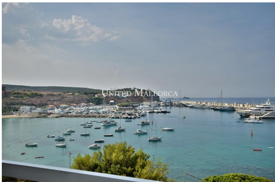
FRONTLINE APARTMENT WITH DIRECT ACCESS TO THE SEA