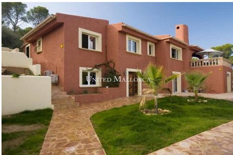
MODERNIZED VILLA WITH PANORAMIC VIEWS IN COSTA DE LA CALMA