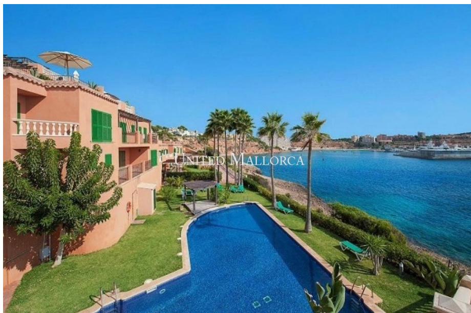
LUXURY FRONT LINE APARTMENT IN PORT ADRIANO