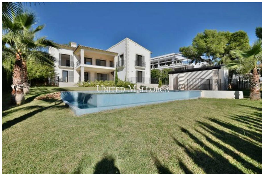
MEDITERRANEAN LUXURY VILLA, SOUTH FACING WITH SEA VIEWS